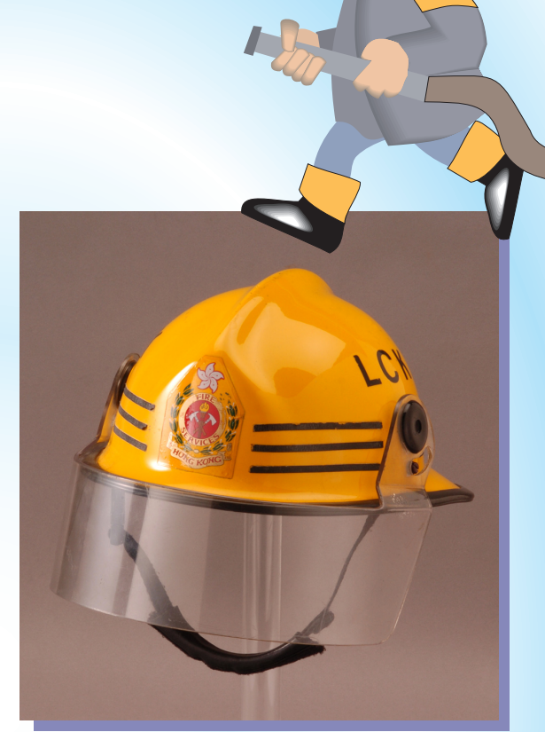
Fire helmet worn in 2007