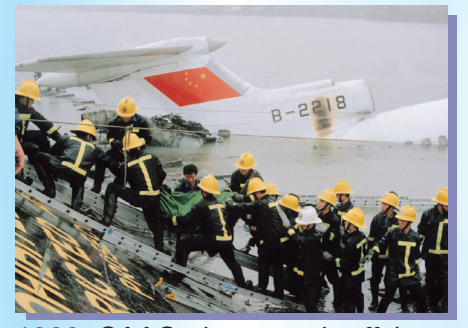
1988, CAAC plane crash offshore.

Rescue work for ______ occurring on ships at sea and along the coast.