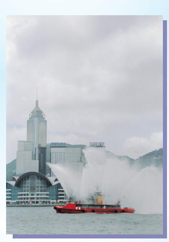
2002, Victoria Harbour