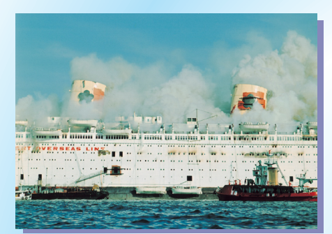
1972, the fire on Seawise University

What rescue operations did the Alexander Grantham take part in? Look at the pictures below and write the answers in the spaces provided.