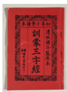
1930 年代香港百利書店印行的 《訓蒙三字經》 Xunmeng Sanzijing ("Three Character Classic for early learners"), printed by Pak Lei Bookstore of Hong Kong, 1930s.

Before the middle of the 19 th century, two main types of teaching materials were used throughout China: textbooks intended to provide enlightenment and books used to prepare for the imperial examinations. Other common reading materials included biographies, poetry compilations, texts on the rhyme, rhythm and form of classical Chinese poetry, and books written specifically for the education of girls. The publication of new textbooks in modern China saw rapid progress in the early 20 th century. These textbooks were not only used in primary and secondary schools, but also in overseas Chinese communities, especially in Southeast Asia. Games and toys are a perfect complement to textbooks, as they help inspire creativity and promote physical and mental development of children. Learning through play is a tried and trusted pedagogical concept of modern education practices today. This exhibition showcases different types of Chinese textbooks that were published in mainland China and Hong Kong from the early to mid-20 th century, giving a glimpse into the development of textbooks and the importance of children's play in teaching.