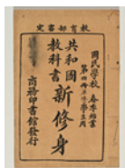
1922 年商務印書館發行的 《共和國教科書：新修身》(第四冊) Gongheguo Jiaokeshu: Xinxiushen ("Textbook for the Republic: New personal growth", book 4), distributed by The Commercial Press, 1922.