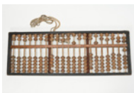
早期教學用的算盤 Abacus for teaching mathematics