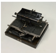
舒式華文打字機 Shu-style Chinese Typewriter