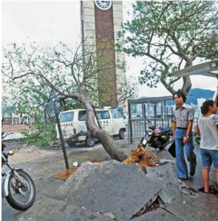
Hong Kong in the aftermath of Typhoon Hope in 1979.