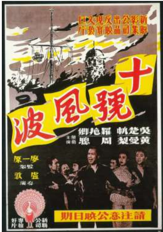
Poster of a 1959 Cantonese movie, titled “Typhoon Signal No. 10”, about how the people in a neighbourhood came to the assistance of each other under the threat of a severe typhoon.