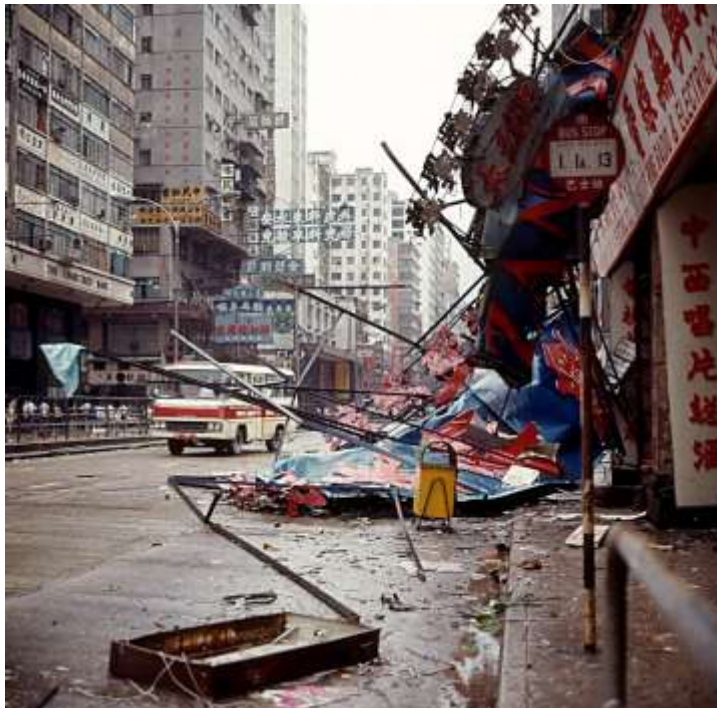
Hong Kong in the aftermath of Typhoon Rose in 1971.