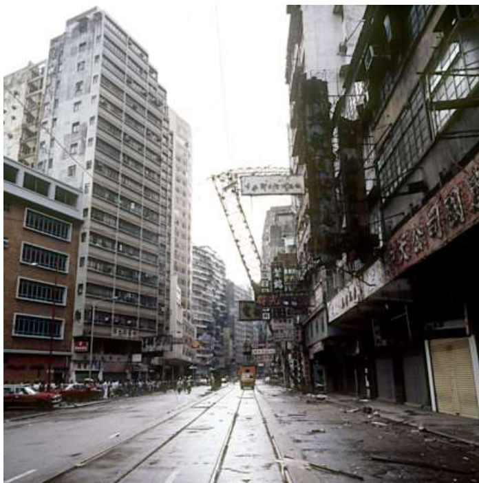
Hong Kong in the aftermath of Typhoon Ellen in 1983.