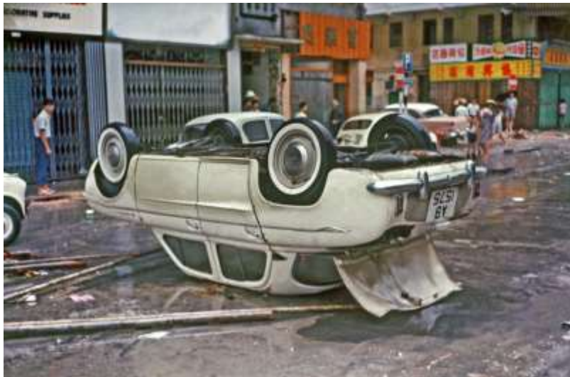
Hong Kong in the aftermath of Typhoon Wanda in 1962.