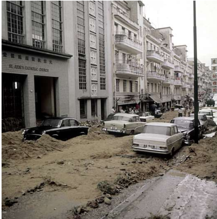
Hong Kong in the aftermath of Typhoon Ruby in 1964.