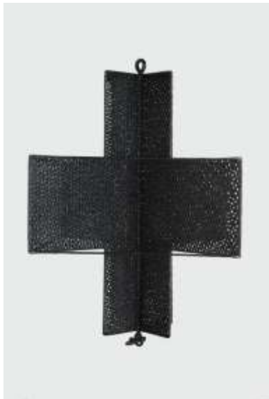
Tropical Cyclone Warning Signal No. 10, used by the Hong Kong Observatory until 2002, was made of iron and weighed up to 25 kilograms.