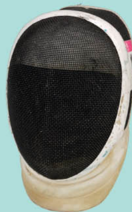
Protective equipment worn by Luan Jujie when she won the gold medal in women's fencing at the 23rd Olympic Games in 1984.