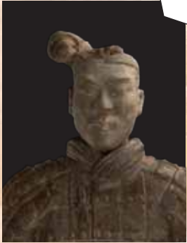
14. 髮髻 Bun 冠帽 Cap

Can you identify the different styles of buns and caps and match them with the terracotta warriors?