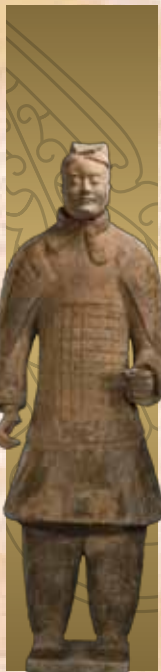
鎧甲下級軍吏俑 Terracotta junior armoured officer