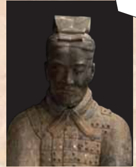
18. 髮髻 Bun 冠帽 Cap