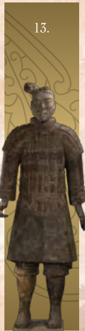
( ) 俑 Terracotta armoured ( )