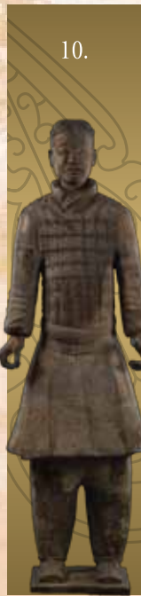
( ) 俑 Terracotta ( )