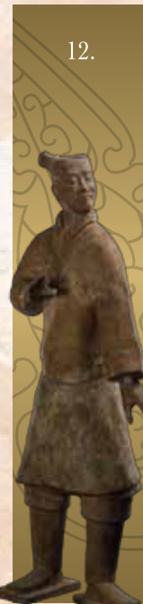
( ) 俑 Terracotta ( ) archer