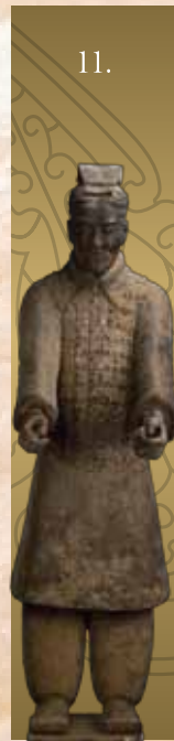
( ) 俑 Terracotta armoured ( )