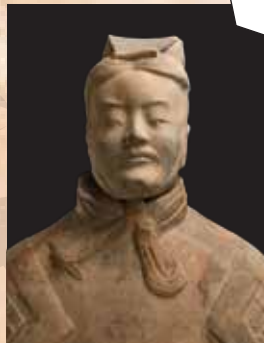
16. 髮髻 Bun 冠帽 Cap