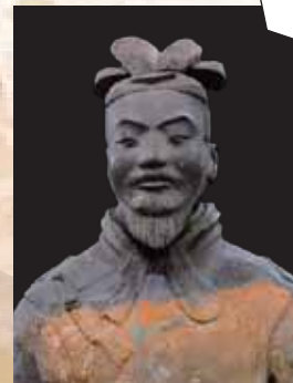
17. 髮髻 Bun 冠帽 Cap