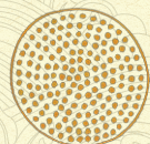
12. 粉米 Grain