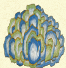
7. 山 Mountains