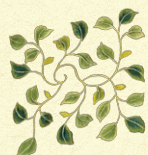
4. 藻 Waterweed