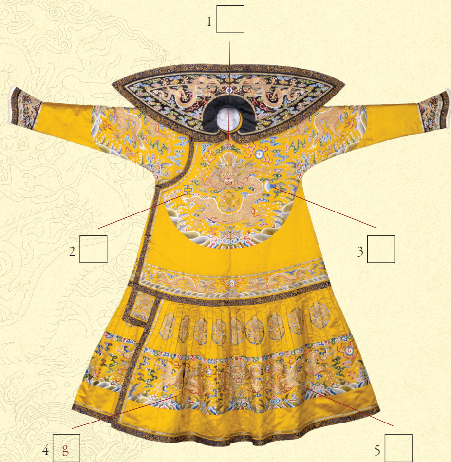
朝袍正面 The front of the court robe