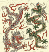
9. 龍 Pair of ascending and descending dragons