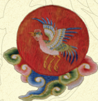
6. 日 Sun