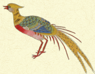
10. 華蟲 Pheasant