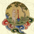
8. 月 Moon