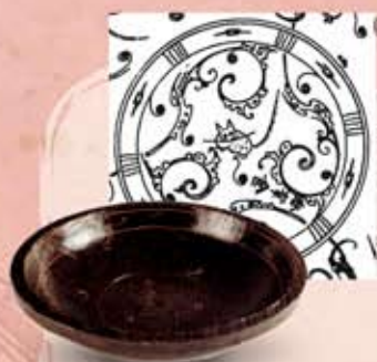
17 Painted lacquer dish

A great variety of lacquerware was discovered in the tombs, all displaying high-quality craftsmanship and designs. Can you identify the patterns and what they symbolised?