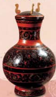
18 Painted lacquer zhong vessel