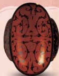
19 Flanged lacquer cup with inscription " junxingjiu "