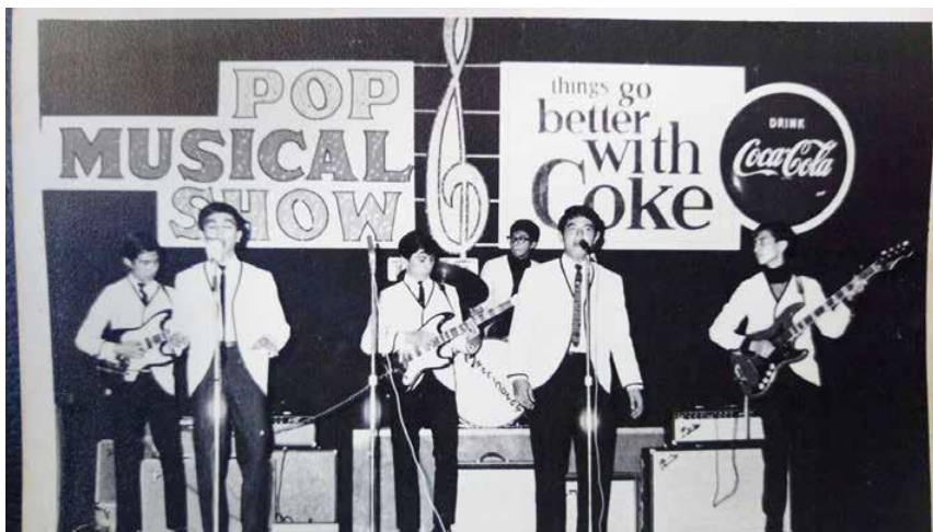
The Mystics performing at the Pop Musical Show.