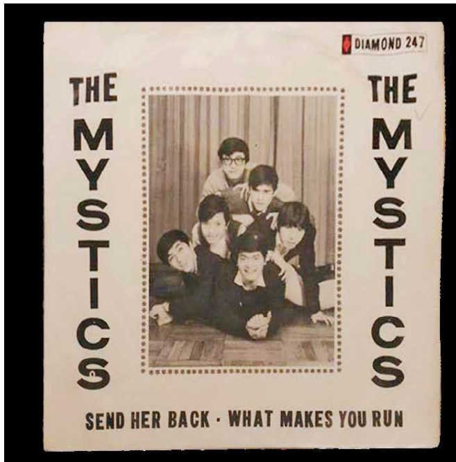
Released in 1967, "Send Her Back" is the single that made The Mystics famous.