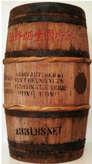
Barrel of soybean sauce shipped from Hong Kong to the US.