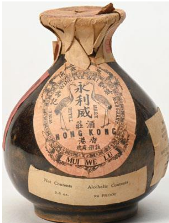
Hong Kong-brand rose wine for sale in the US.