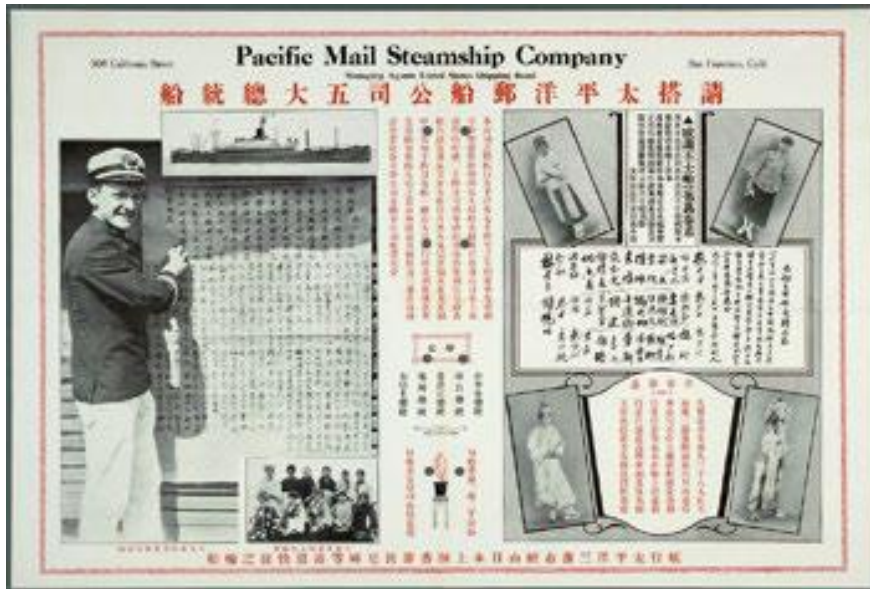
Advertisement by the Pacific Mail Steamship Company, which specialized in scheduled routes between San Francisco, in the US, and Hong Kong.